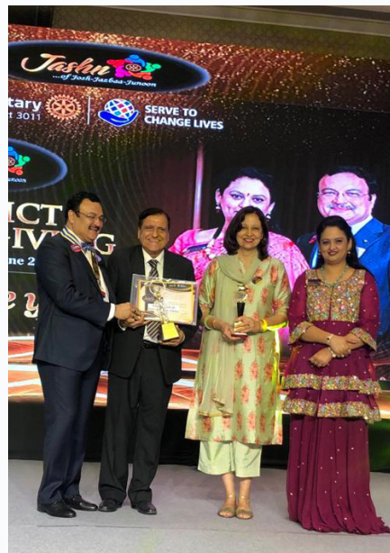
A Diamond Club & Diamond President Trophy