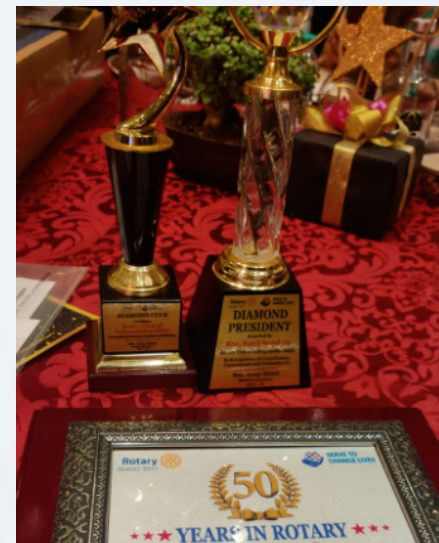
Awards for RCIO